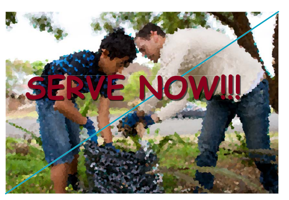
Don't place graphics or text over photos or use graphic filters.